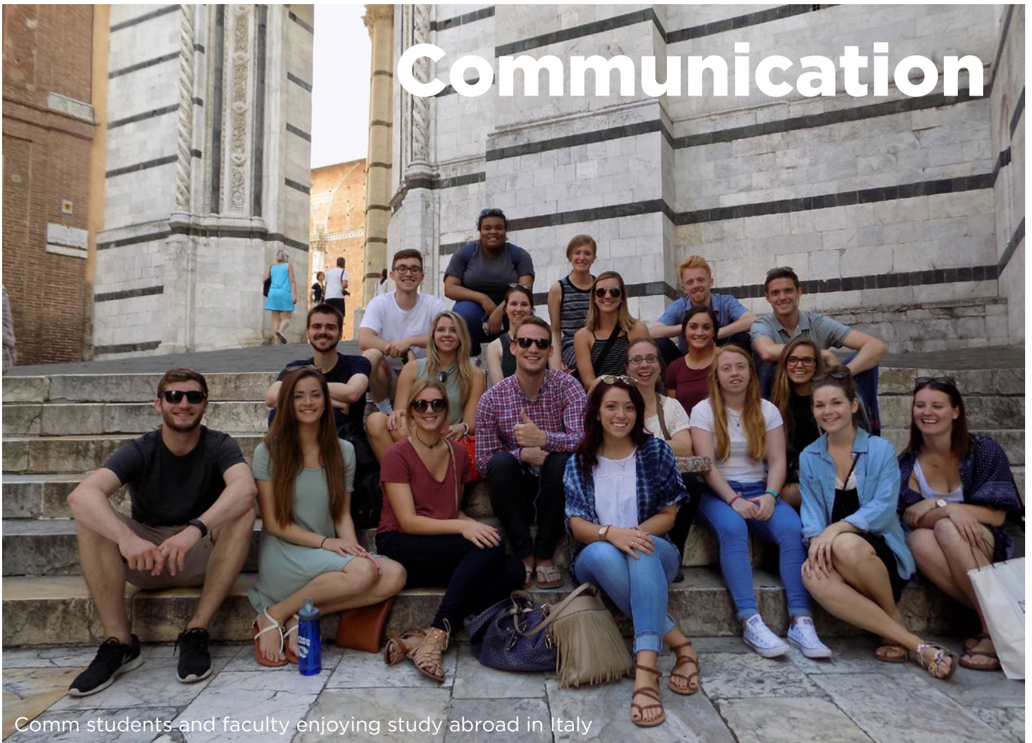
Comm students and faculty enjoying study abroad in Italy